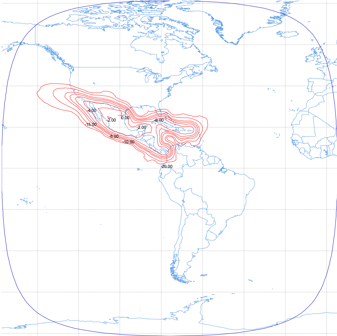
Figure B-1. DIRECTV KU-76W Receive Beam