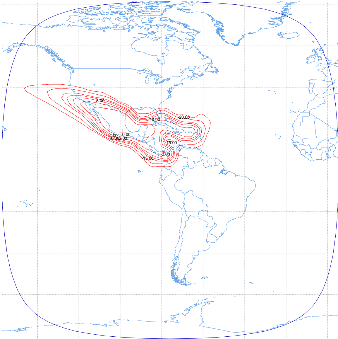
Figure B-2. DIRECTV KU-76W Transmit Beam